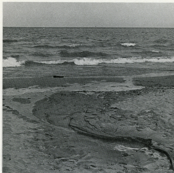
"ACCUMULATION — INTEGRATION"

The establishment of a system for identification and community.