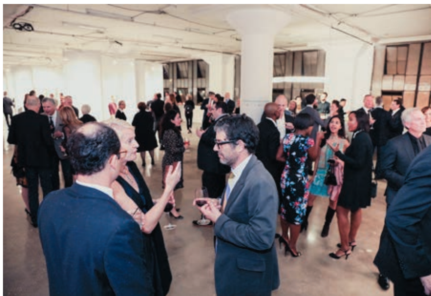
RenBen 2016 guests