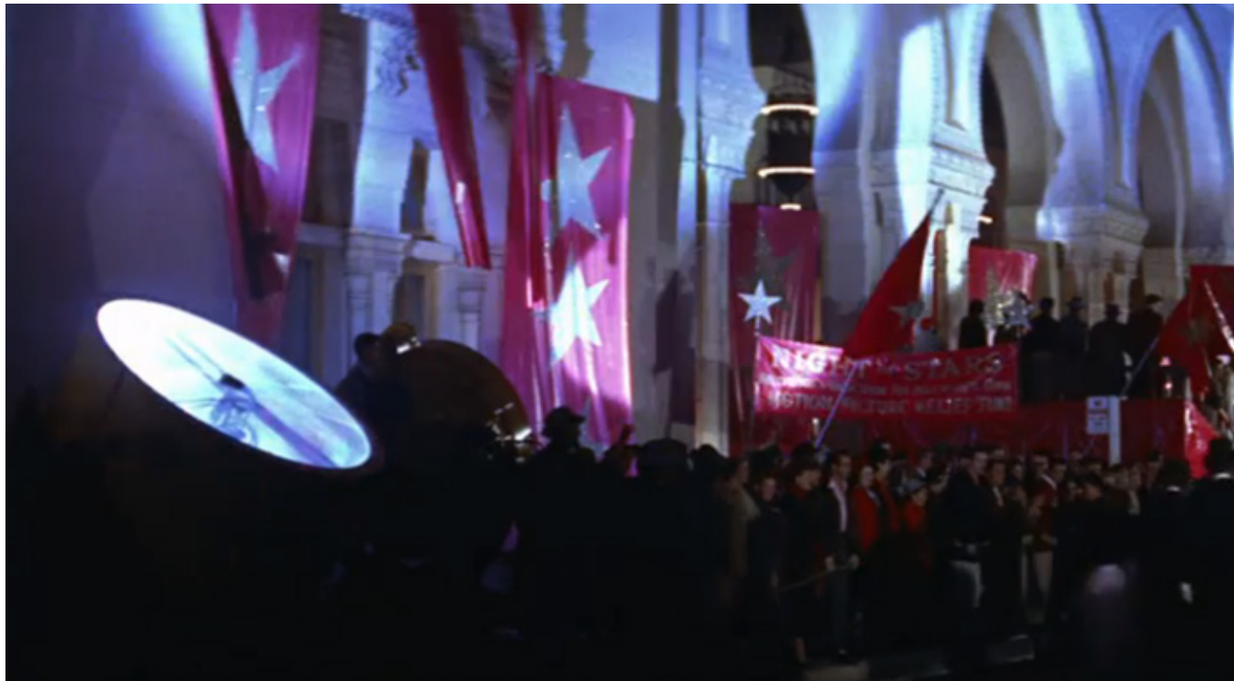
Film still detail from A Star Is Born , 1954, directed by George Cukor.